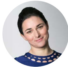
Dame Sarah Storey

Active Travel Commissioner, Sheffield City Region LEP